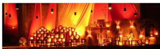
TAIZÉ PILGRIMAGE 2025 SUN 10TH AUGUST TO SUN 17TH AUGUST

From the start of the new term after Easter, this will meet every Friday. It will run from 8.30 am to 10.30 am and will be held at the new Community Hub next to Kents Hill School, directly opposite the church.